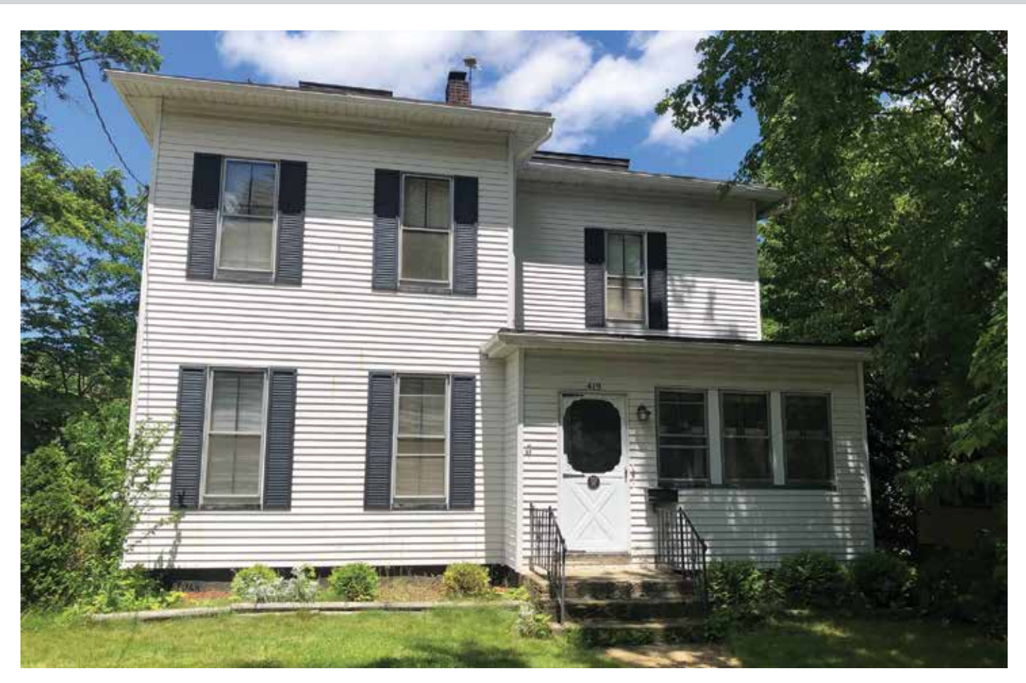
Information is believed to be accurate but not guaranteed. KIKO Auctioneers

Directions: Take Rt. 43 north of Haymaker Pkwy. (Rt. 59) to Rockwell St. and west to address. Watch for KIKO signs..